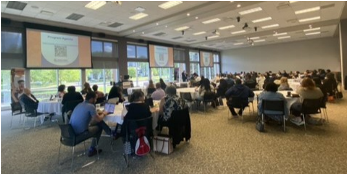
Illinois Works Pre-Apprenticeship Grantees at the Regional Meeting.