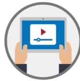
Webinar Recordings & Materials