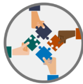
ACME Transition Scope & Lifecycle