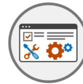
FAQs and Announcements