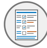
Full List of Resources